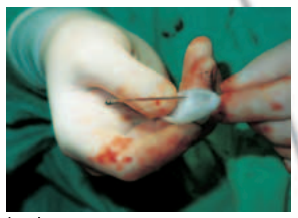
(Fig.5) Insertion of the guidewire into the handle.